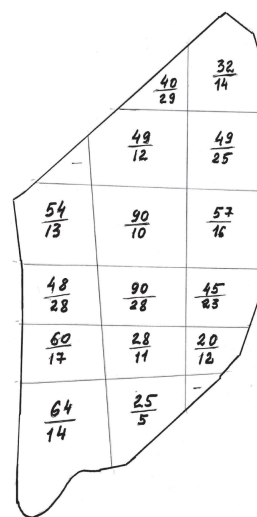
3. ábra Az E01 (a számlálóban) és a Q-tényező (a nevezőben 10 -3 -kal szorozott) amplitúdójának eloszlása az elektro-elasztikus rezgésekkel a citrinlemez celláiban

Studies on the distribution of quality factor and response amplitudes electro-elastic vibrations over regions of a citrine polished plate with dimensions 275·122 mm 2 and thickness 4 mm (Fig. 3) were also carried out. This plate is made of a large mineral. In the center of the citrine plate, the response amplitudes are E 01 = 90, and at the edges less than E 01 ≈ 60, which corresponds to the fact that the crystallinity at the center of quartz minerals is better than at the edges. The quality factor is Q ≈ 28·10 3 in the center of the citrine plate, and more than Q = 15·10 3 at the edges, which corresponds to the fact that the amount of impurities, especially Al, is much larger at the edges than in the center. The largest values of the amplitude of the electro-elastic response E 01 correspond to the two central cells of the mineral plate. It was hypothesized that the central regions of the mineral have a good degree of crystallinity.